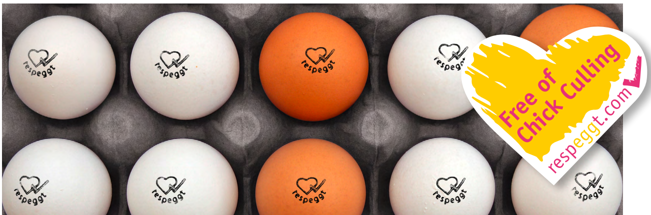
Figure: Respeggt stamp and heart-shaped Respeggt label