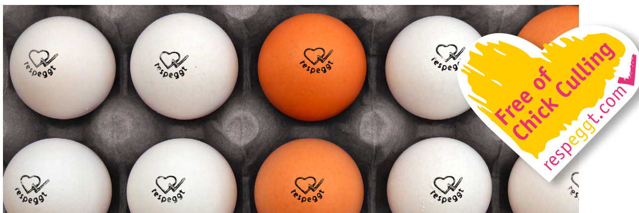
Figure 2: Respeggt stamp and heart-shaped Respeggt label