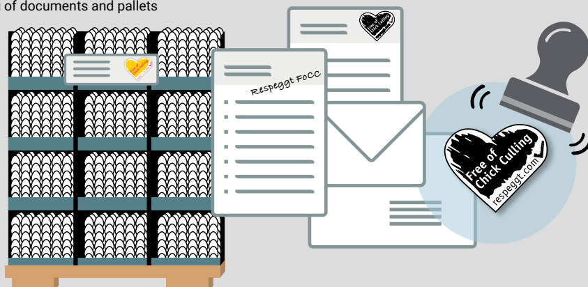
Figure 3: Correct marking of documents and pallets

All Respeggt system partners in a supply chain shall always mark any relevant documentation, e.g., labels, delivery notes, transport documents and invoices, with the references "Respeggt OKT" (Ohne Küken-töten) or "Respeggt FoCC" (Free of Chick Culling), or with the Respeggt document stamp. Additionally, a specification for "Respeggt FoCC" must be created and used in the merchandise management system by Respeggt system partners. It does not suffice to solely use the reference "FoCC" or "Free of Chick Culling" as a marking.