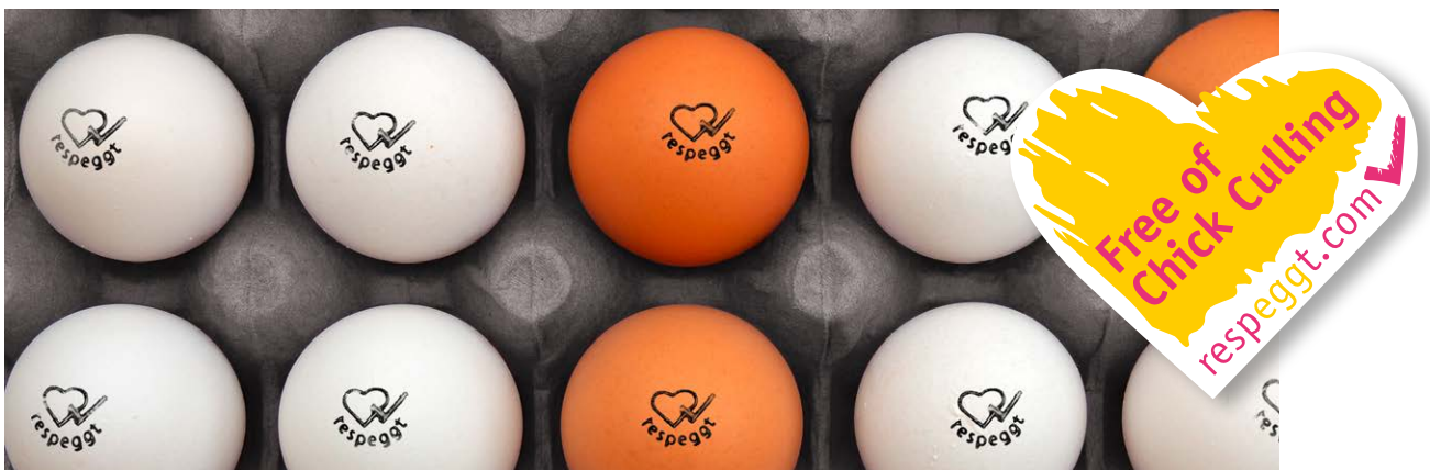
Figure 2: respeggt stamp and heart-shaped respeggt label